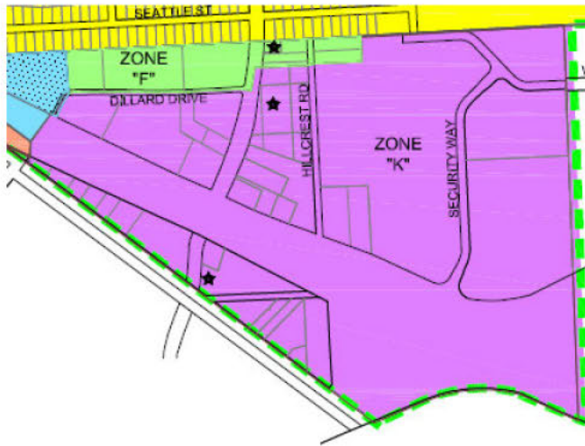
District K as of December 16, 2024