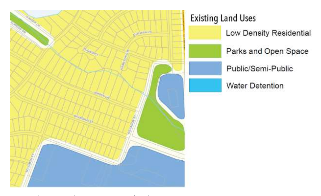
Map 3: The existing land use zoning within the TIRZ.