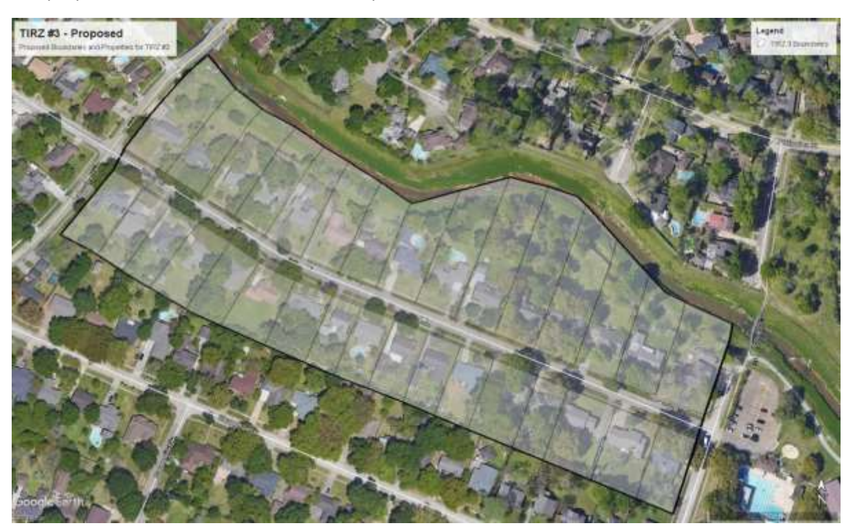
Map 1: Location of Proposed Tax Increment Reinvestment Zone The proposed boundaries of the TIRZ are depicted below.

Given the length of time it will be for home elevation grants to reach all homes, the home owners of Jersey Drive have submitted a petition to the City requesting a TIRZ to be created to assist with flood mitigation, namely buyouts, on their street. The TIRZ would help to facilitate the sale of property from the current owners, so the homes could be demolished, and new homes could be built on the lots that would be above the flood plain. This would bring about flood mitigation for property owners more quickly that working with federal funding. It would also allow for the property to continue to provide great homes for future generations of families in Jersey Village.