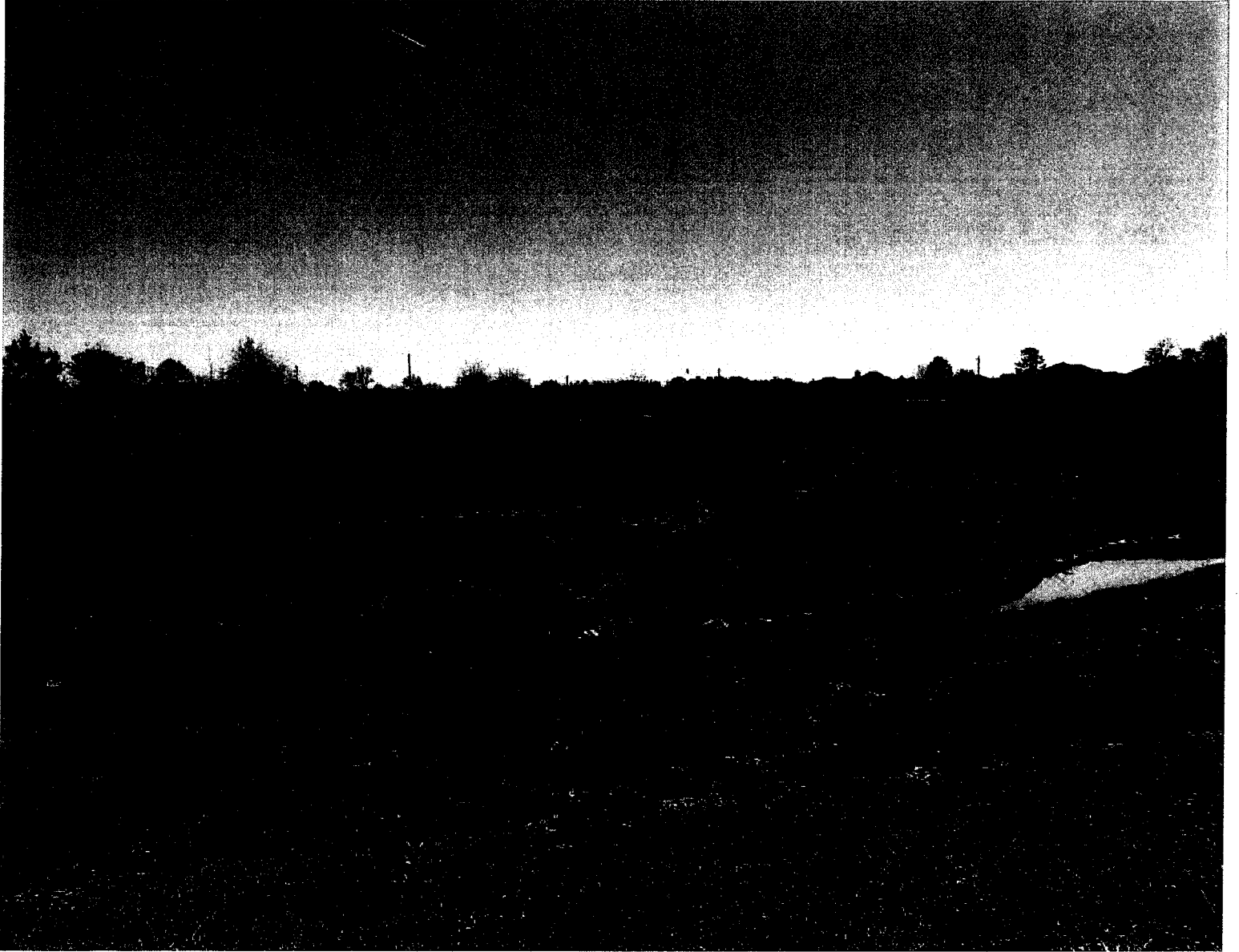
ENTRANCE TO BYPASS ON DRY DAY