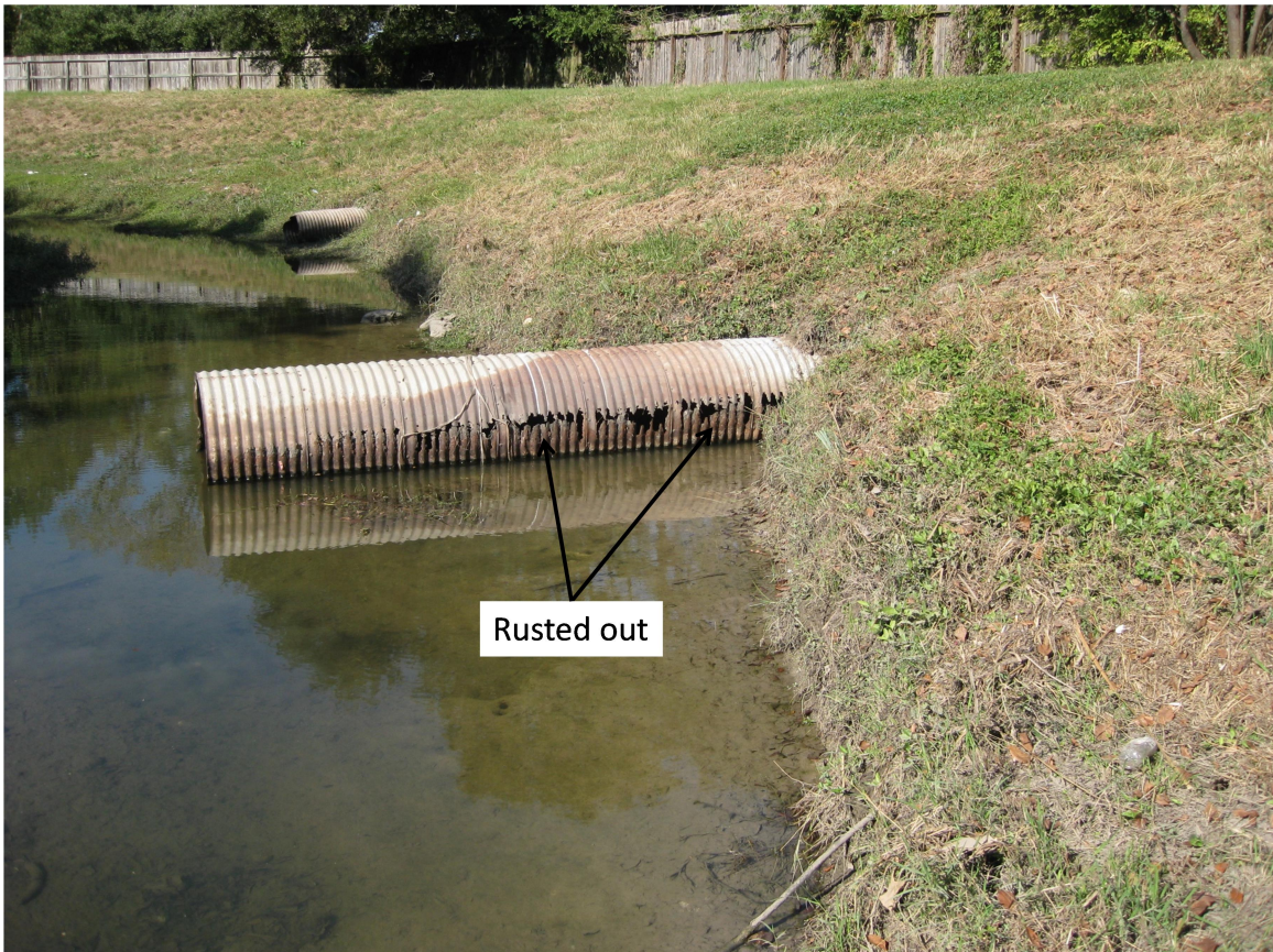
Looking west; the storm drain is rusted out along both sides.