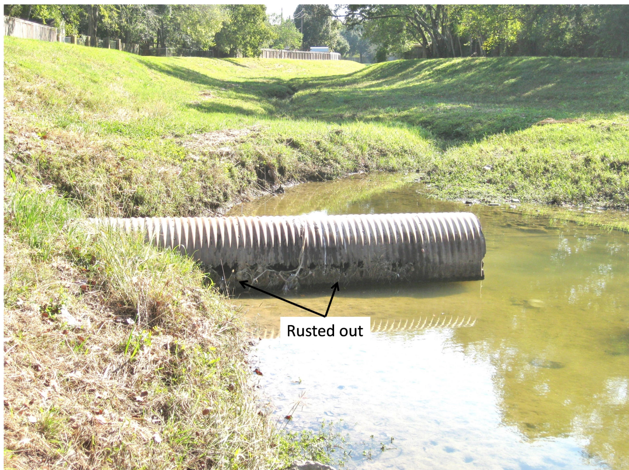
Looking east; the storm drain is rusted out along both sides.